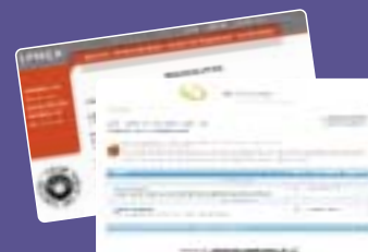
LPHCA Forum board page 43