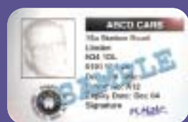
Driver I.D. badges page 6