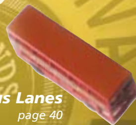
Bus Lanes page 40