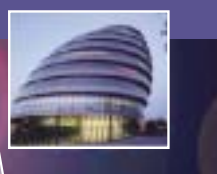
Safer travel at night page 38