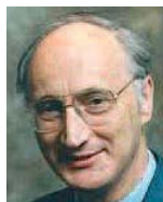
Sir George Young

Then as more years of despair loomed a golden moment came when Sir George Young, (by this time in opposition), also won the right to introduce a Private Member's Bill into Parliament. Our luck was finally changing.