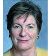
Dr Jenny Tongue

With a former Secretary of State in Sir George introducing what was a bill from the government's opposition, we had a lot of work to do but with a fully briefed new London Minister in Glenda Jackson backing us and support from the Liberal's Dr Jenny Tongue MP, we were able to secure the desperately needed 'all party support' for the Bill.